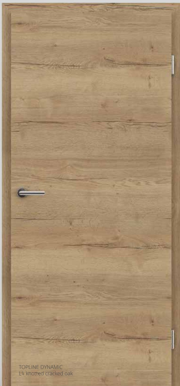
TOPLINE DYNAMIC L1 knotted cracked oak

The new expanded offer of DYNAMIC foil coated surfaces with a rough 3D surface structure is a great and pleasing substitute for classic OAK veneered doors.