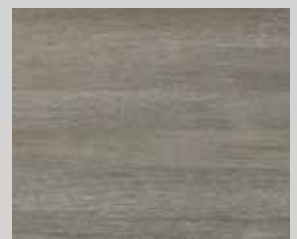
TOPLINE L1 oregon pine