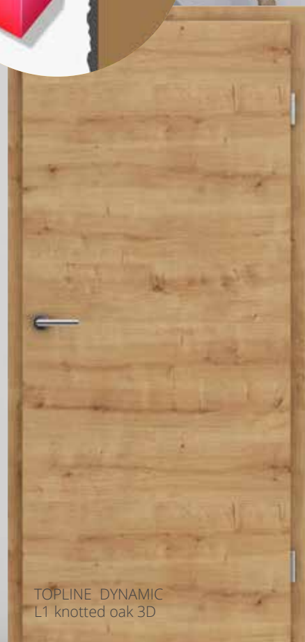
TOPLINE DYNAMIC L1 knotted oak 3D