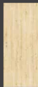
model P1 Vertical structure