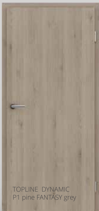
TOPLINE DYNAMIC P1 pine FANTASY grey