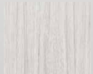
TOPLINE palisander white