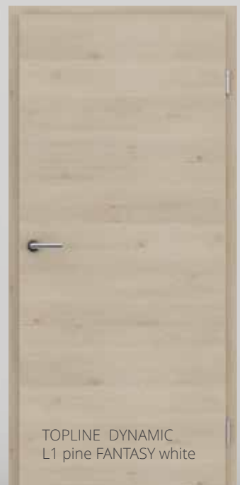
TOPLINE DYNAMIC L1 pine FANTASY white