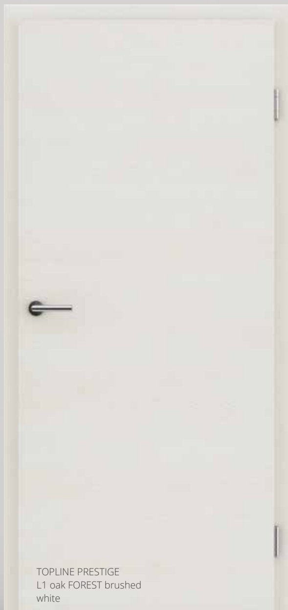
TOPLINE PRESTIGE L1 oak FOREST brushed white

Surfaces have synchronised pores to achieve the look of genuine SOLID WOOD.