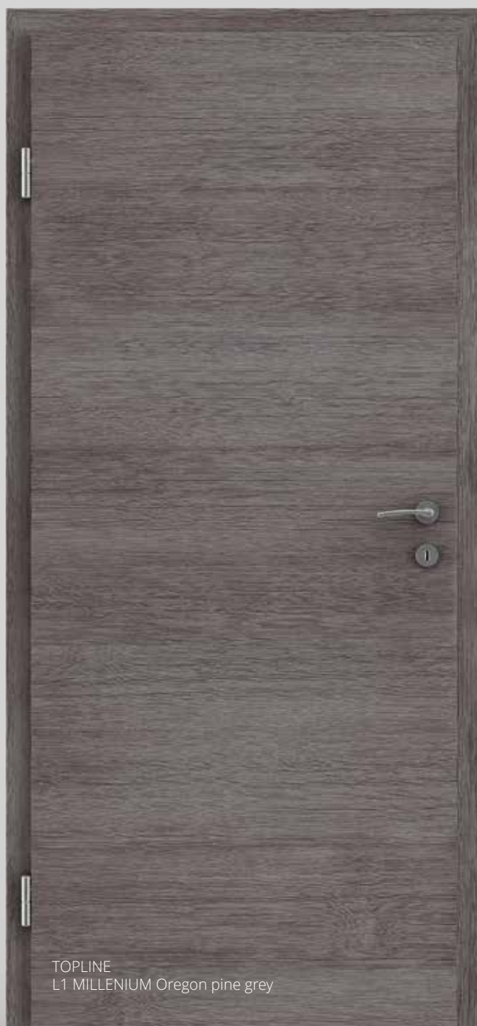
TOPLINE L1 MILLENNIUM Oregon pine grey