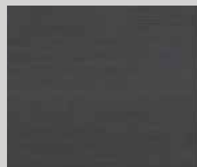
TOPLINE L1 oak graffito