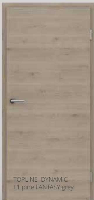
TOPLINE DYNAMIC L1 pine FANTASY grey