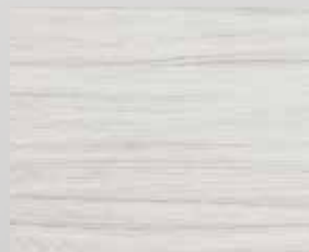
TOPLINE L1 palisander white