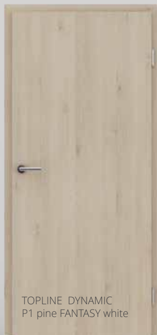
TOPLINE DYNAMIC P1 pine FANTASY white