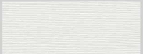
TOPLINE L1 snow-white