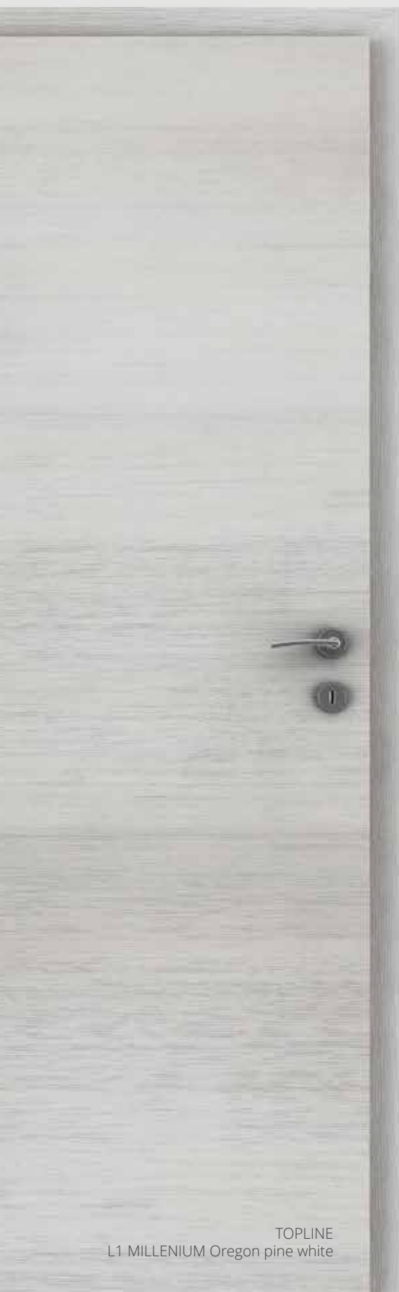
TOPLINE L1 MILLENNIUM Oregon pine white

The elaborate surface structure of FINE-LINE veneer will impress you.