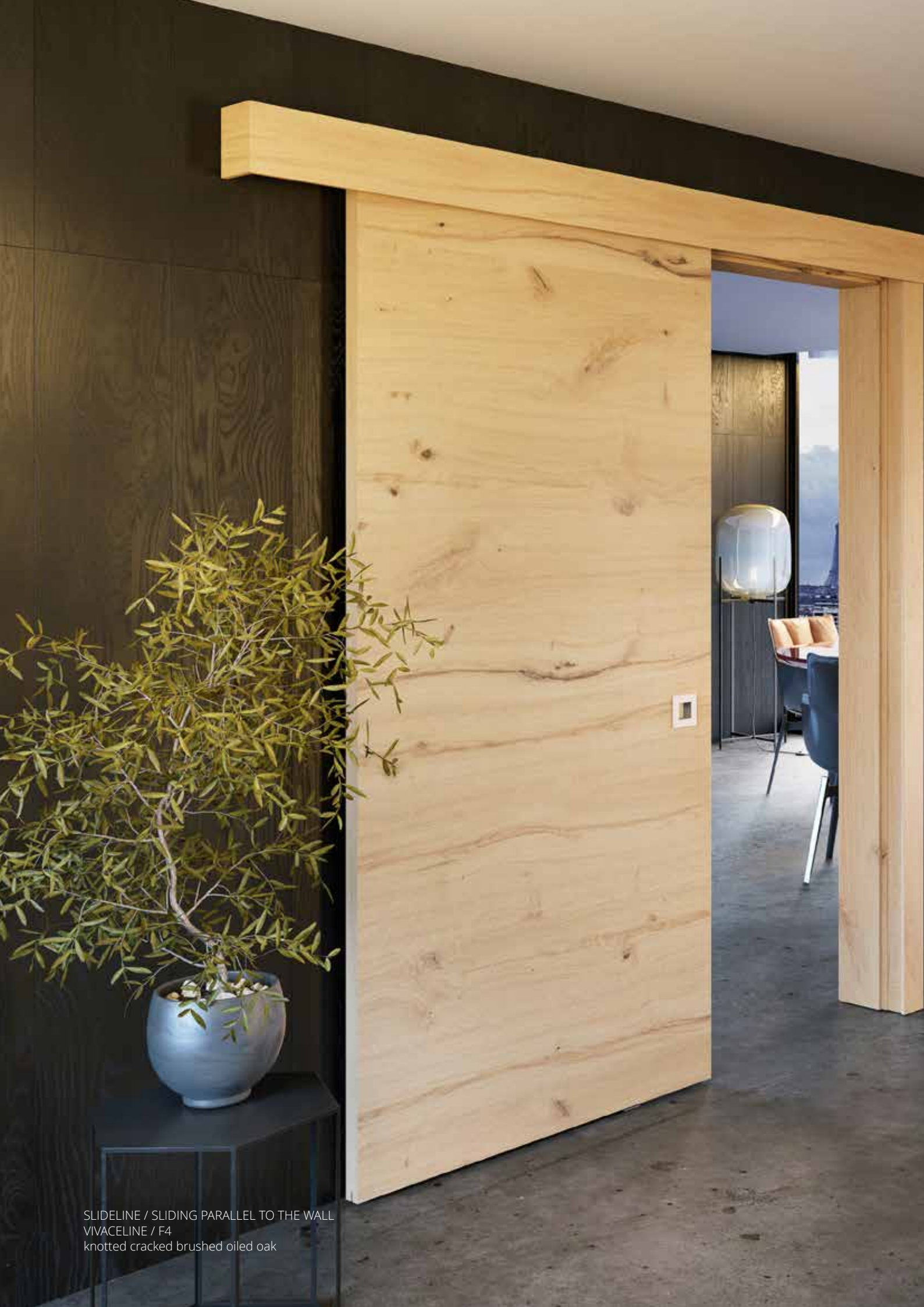
SLIDELINE / SLIDING PARALLEL TO THE WALL VIVACELINE / F4 knotted cracked brushed oiled oak